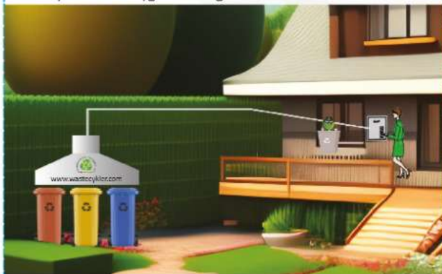
A chimneyless waste transportation system that reaches the garbage bins without leaving home

Since there is no garbage room in these models, the garbage cans are in the garden or farther from the houses, the transportation problem of people causes serious difficulties especially for the elderly. WASTECYKLER automatically carries and separates your garbage without leaving your home. With these features, it prepares more comfortable, more convenient, environmentally friendly and more hygienic living environments.